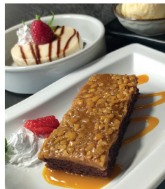
DE14 STICKY TOFFEE PUDDING SLICE