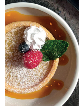
DE11 LEMON TART