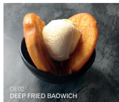
DE02 DEEP FRIED BAO WICH