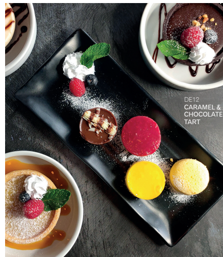
DE12 CARAMEL & CHOCOLATE TART